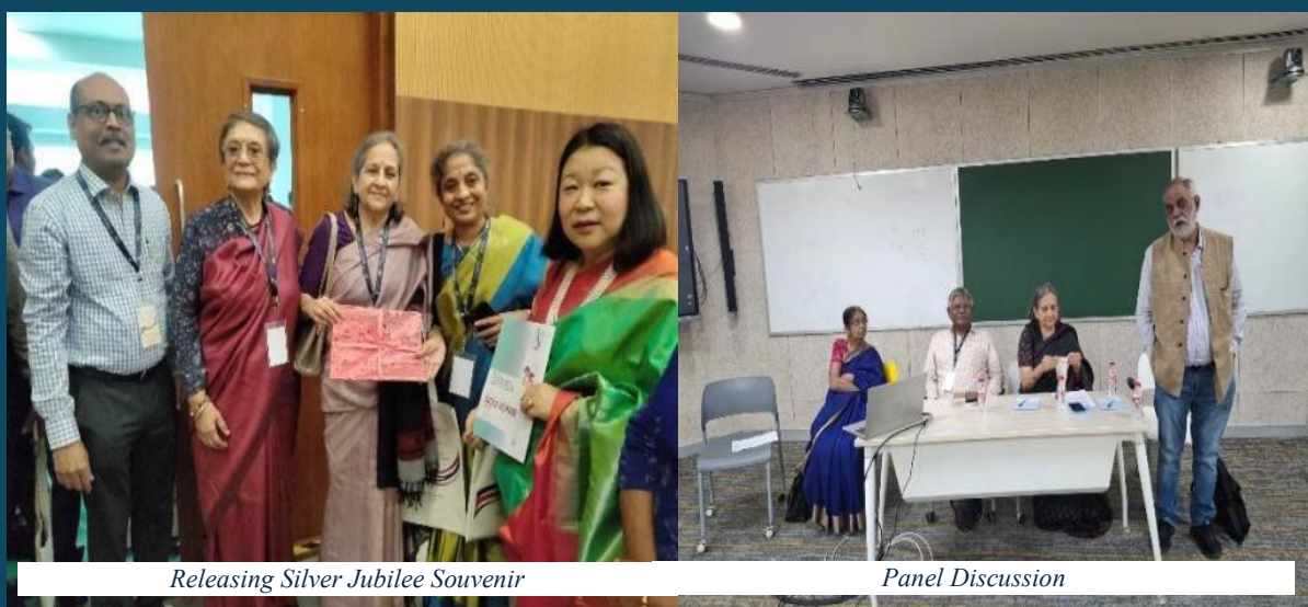
Releasing Silver Jubilee Souvenir